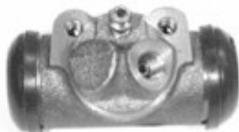
LH REF 105TA4259