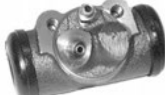
RH REF 105TA4255