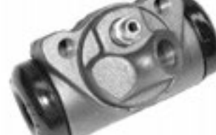
LH REF 106TA6262