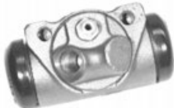
RH REF 106TA6263